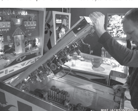
Hankowski inspects the crude electromechanical computer in 1965's Hula Hula

Send your local briefs to editor@montaguereporter.org